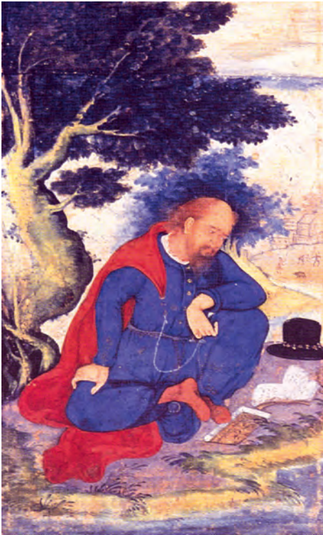
Fig. 5.6 A seventeenth-century painting depicting Bernier in European clothes