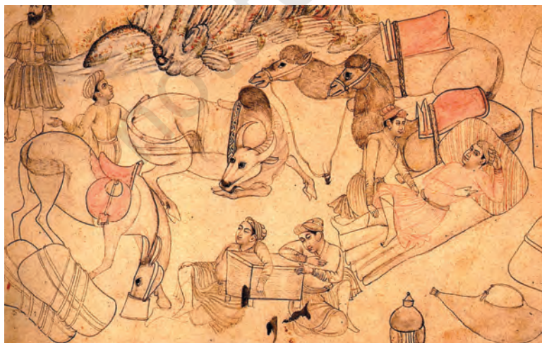
Fig. 5.14 A painting depicting travellers at rest