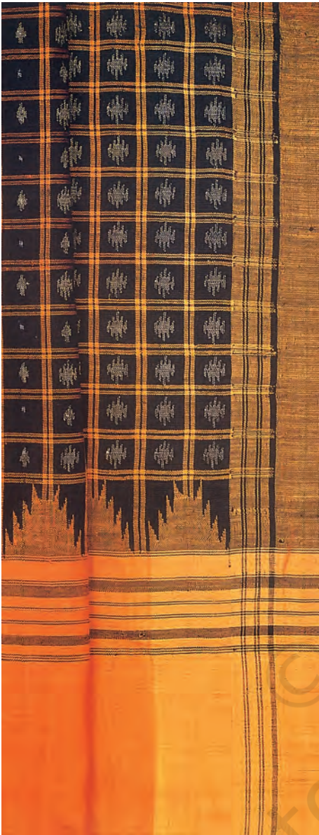
Fig. 5.10 Ikat weaving patterns such as this were adopted and modified at several coastal production centres in the subcontinent and in Southeast Asia.

➡ Why do you think Ibn Battuta highlighted these activities in his description?