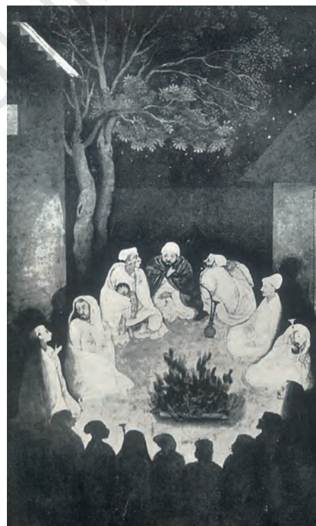
Fig. 5.5 An eighteenth-century painting depicting travellers gathered around a campfire

Among the best known of these writers were Abdur Razzaq Samarqandi, who visited south India in the 1440s, Mahmud Wali Balkhi, who travelled very widely in the 1620s, and Shaikh Ali Hazin, who came to north India in the 1740s. Some of these authors were fascinated by India, and one of them – Mahmud Balkhi – even became a sort of sanyasi for a time. Others such as Hazin were disappointed and even disgusted with India, where they expected to receive a red carpet treatment. Most of them saw India as a land of wonders.