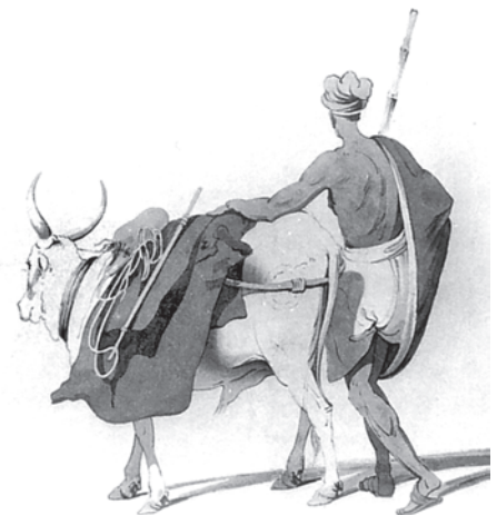
Fig. 5.11 Drawings such as this nineteenth-century example often reinforced the notion of an unchanging rural society.

As an extension of this, Bernier described Indian society as consisting of undifferentiated masses of impoverished people, subjugated by a small minority of a very rich and powerful ruling class. Between the poorest of the poor and the richest of the rich, there was no social group or class worth the name. Bernier confidently asserted: "There is no middle state in India."