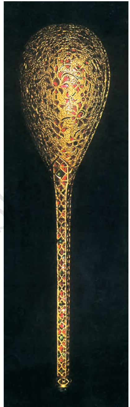
Fig. 5.12 A gold spoon studded with emeralds and rubies, an example of the dexterity of Mughal artisans

➔ In what ways is the description in this excerpt different from that in Source 11?