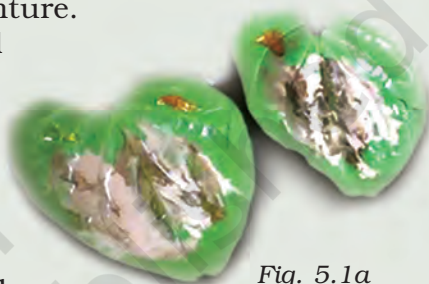
Fig. 5.1a Paan leaves

In this chapter we shall see how our knowledge of the past can be enriched through a consideration of descriptions of social life provided by travellers who visited the subcontinent, focusing on the accounts of three men: Al-Biruni who came from Uzbekistan (eleventh century), Ibn Battuta who came from Morocco, in northwestern Africa (fourteenth century) and the Frenchman François Bernier (seventeenth century).